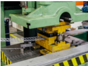
Stamping and Pressing