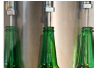
Glass Bottle Manufacture