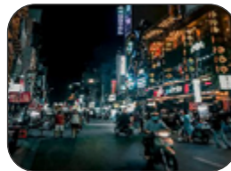
Ho Chi Minh city