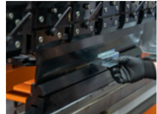
Sheet Metal Fabrication